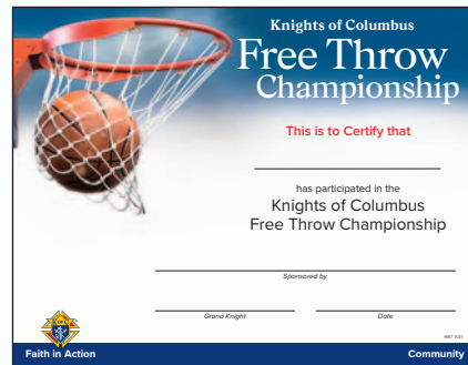
Free Throw Participation Certificate (#1597)