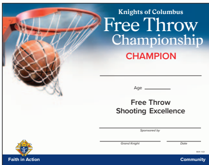
Free Throw Champion Certificate (#1809)