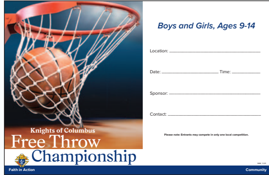
Free Throw Promotional Poster (#1686)